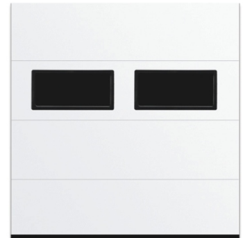
34" x 16" Lites