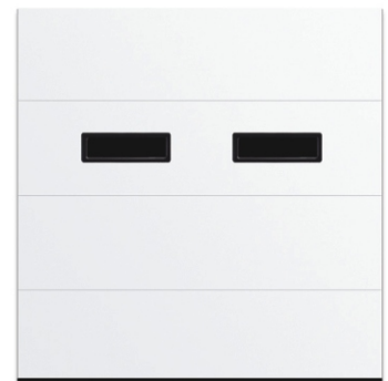
24" x 8" Lites

Meets or exceeds standards of ANSI/DASMA 102-2011, Specifications for Sectional Doors.