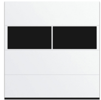
Full View Section